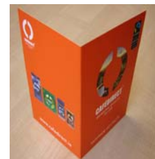
Key facts card